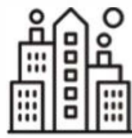
Community- First Approach